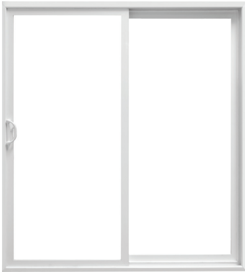
Imperial Sliding Patio Door

Imperial Series sliding patio doors are manufactured with extruded vinyl and are virtually maintenance free. Featuring 1" insulated glass units for improved energy efficiency.