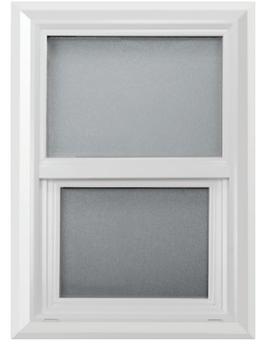
Imperial Series single hung window, obscure glass