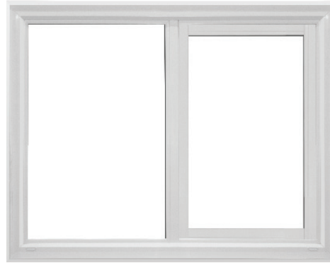
Imperial Series sliding window

Imperial Series windows feature a slim frame for maximum viewing area, standard LoE3 glass and frame types for every application. A preferred choice for convenience and functionality.